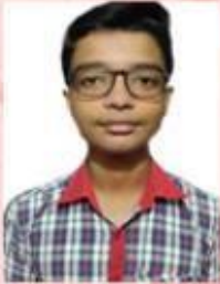
VISHNU K 96.4